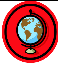
Text to World