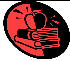
Text to Text